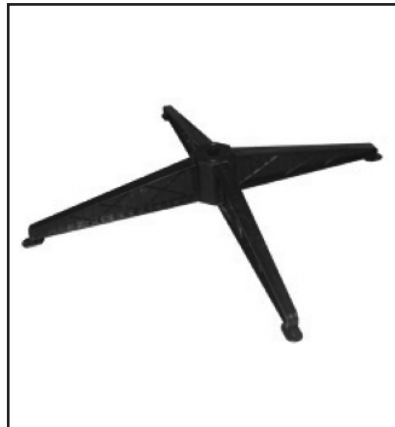
STEP 2 (Figure C)